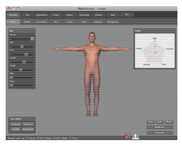
Figure 2. Implementation of a 3D-model

One possibility to implement the temporal as well as the spatial adjustment of the visual feedback is to utilize a 3Danimation controlled by a dynamics simulation of a multibody system. The latter will be achieved by biomechanical multi-body simulations using the object-oriented class library MBSLIB presented in [20]. By obtaining joint trajectories from a biomechanical forward kinematic simulation, the motion of the virtual character and the participant can be adjusted and synchronized. It is assumed that such a representation already exists in order to control the biodynamical simulation unit of the concept that is described in [21]. Figure 2 shows a possible threedimensional visualization of a virtual character that can be actuated by simulated joint trajectories. This character can be created using the software MAKEHUMAN [21] that is designed to produce three-dimensional characters. Beyond this basic three-dimensional model, extensions as hair and clothes and the adaptation of those to the ones of the particular participant are feasible.