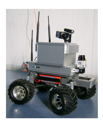
Fig. 1. Current robotic vehicle "Monstertruck".

For the autonomy challenge the team plans to use robots based on a R/C model car Kyosho Twin Force as mobility platform (later on referred to as "Monstertruck", Fig. 1). Two of these robots are under development since 1.5 years. They are modified for better autonomous vehicle handling and enhanced with an onboard computer and a laser range finder. For the victim identification we developed a vision box, including a visual and a thermal camera. The vision box can be used as a stand-alone component for testing or can be attached to a robot to enable autonomous victim detection. In addition the team currently tries to purchase as soon as possible one of the only recently announced new tracked vehicle Matilda by Mesa Robotics (http://www.mesa-robotics.com/) and to include this for very rough terrain at RoboCup 2009.