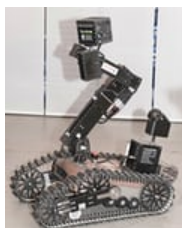
▲ Robot developed by Taurob and TU Darmstadt.