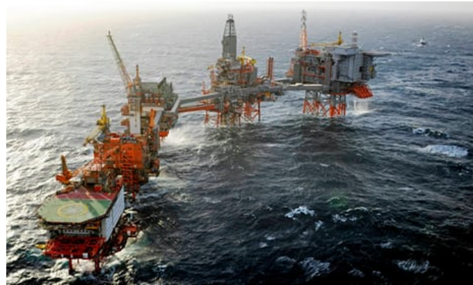
▲ Robots would undertake the task of inspecting rigs and detecting gas leaks in future.

Test to pave way for using autonomous machines for dangerous operations offshore instead of humans