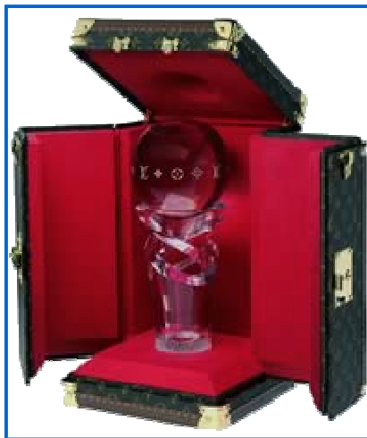
The LV Cup

The Darmstadt Dribblers, a robot soccer team hailing from err, Darmstadt, are the Lionel Messis of the robot soccer world. Or, considering how early robot soccer is in it's development, perhaps it's more accurate to say they are that-one-guy-from-medieval-England-who-was-really-good-at-kicking-the-sheep-bladder-arounds of the robot soccer world.